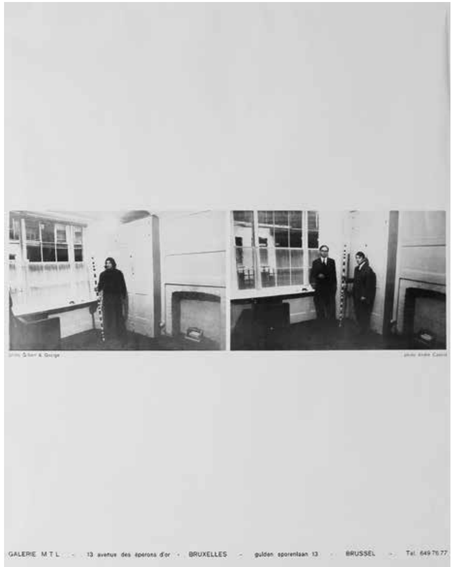
Above: Galerie MTL poster of André Cadere and Gilbert & George, 1975.

Opposite page, from left: André Cadere, Barre de bois rond B 02010003 (Round Bar of Wood B 02010003), certified 1978, paint on wood, 28 3/8 × 1 3/8 × 1 3/8". André Cadere, Barre de bois rond A 02310040 (Round Bar of Wood A 02310040), certified 1977, paint on wood, 32 3/8 × 1 3/8 × 1 3/8". André Cadere, Barre de bois rond B 00201030 (Round Bar of Wood B 00201030), certified 1975, paint on wood, 80 7/8 × 4 × 4". André Cadere, Barre de bois cubique (Cubic Bar of Wood), certified 1971, paint on wood, 77 3/4 × 1 3/8 × 1 3/8". Installation views, Ortzar Projects, New York, 2022.