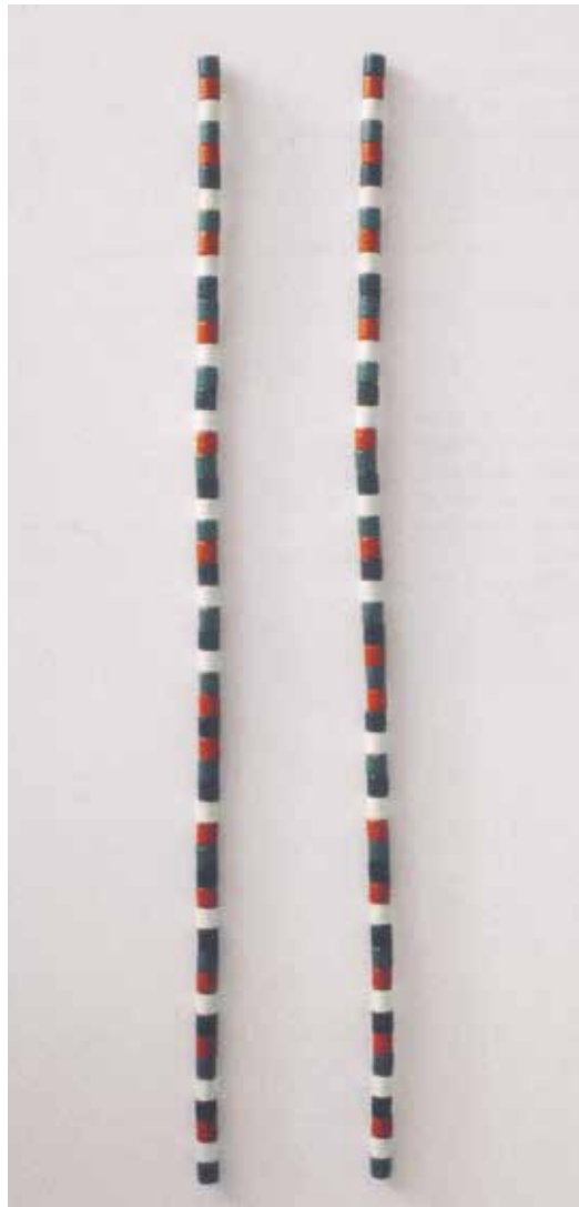
Right: André Cadere, Barres de bois rond B 13020004 (Double) (Round Bars of Wood B 13020004 [Double]), certified 1974, paint on wood, 48 x 1 x 1".

preferred by Fernand Spillemaeckers's artist wife, Lili Dujourie, or was it, as she insisted, "chosen for no other reason than that [the letters] formed a pleasing combination"?